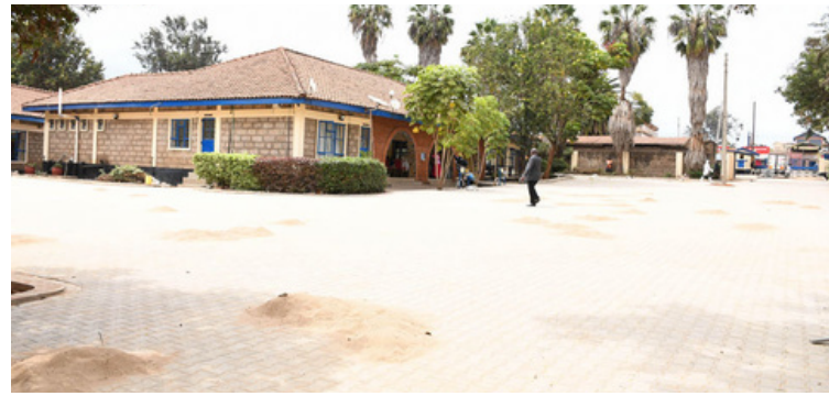
Progress of cabro pavement project