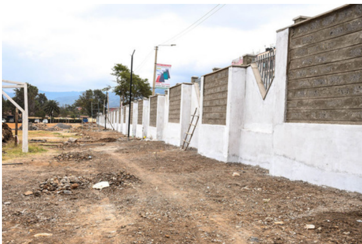
Progress of the perimeter wall project

The University Hotel and Conference Centre remains fully operational despite the ongoing construction activities. Safety measures have been prioritized to ensure the well-being of all guests and staff. Visitors are kindly requested to use the adjacent gate for parking during the construction period.